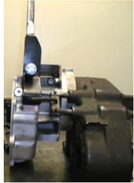
"T" handle linkage installed