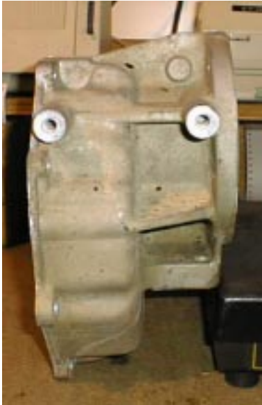
Stock Dodge Adapter