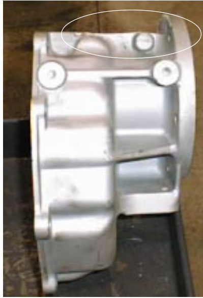
Modified to fit the transfer case shifter linkage