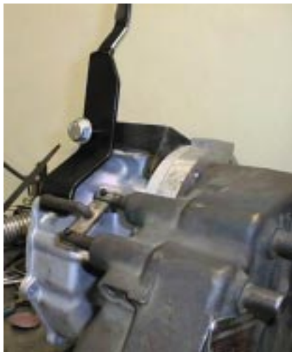
"T" handle linkage installed