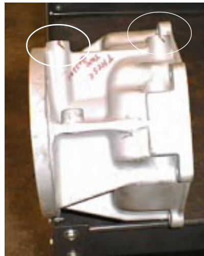
Cut off the stock Dodge shifter bosses

Hardware for the "T" style shifter has not been supplied due to the various different styles of aftermarket shift handles available.